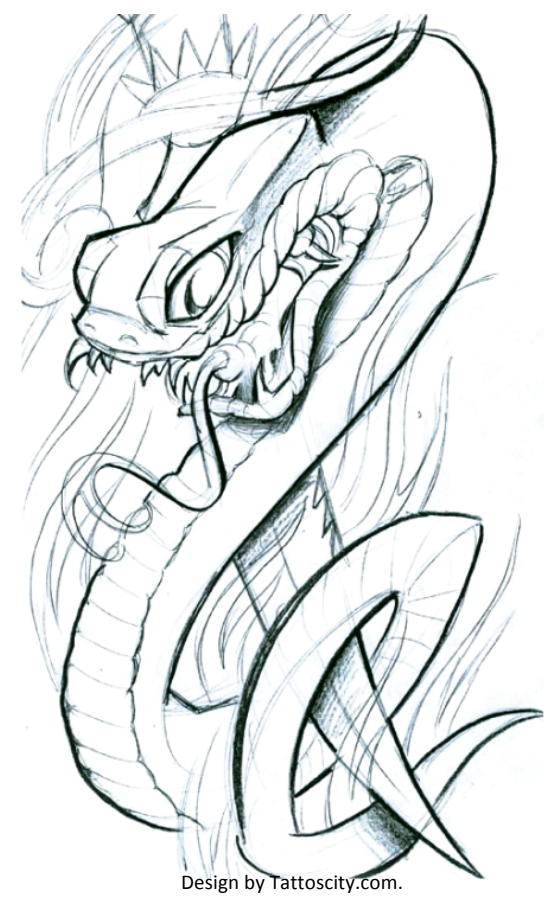
Please note that this is intended to be a placeholder.

They are named for the South American Bushmaster snake ( Lachesis muta ), which is the largest pit viper in the world. Although shy when sought by professionals, it is a highly venomous and aggressive reptile that should be avoided at all costs. It can reach lengths up to 12 feet and has fangs up to two and a half inches long. It is related to a rattlesnake and similar in that it vibrates its tail when alarmed, but the Bushmaster has no rattle. This has lead to one of its nicknames, "The Silent Fate." It has many other nicknames depending upon which region you are in, but in Columbia it is known as Verrugosa because its scales often resemble spiky warts.